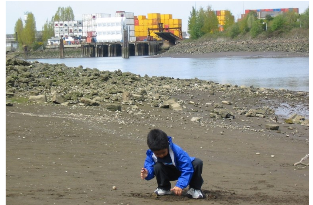
Child playing along Duwamish River

The Urban Waters Federal Partnership will help urban and metropolitan areas, particularly those that are underserved or economically distressed , connect with their waterways and work to improve them.