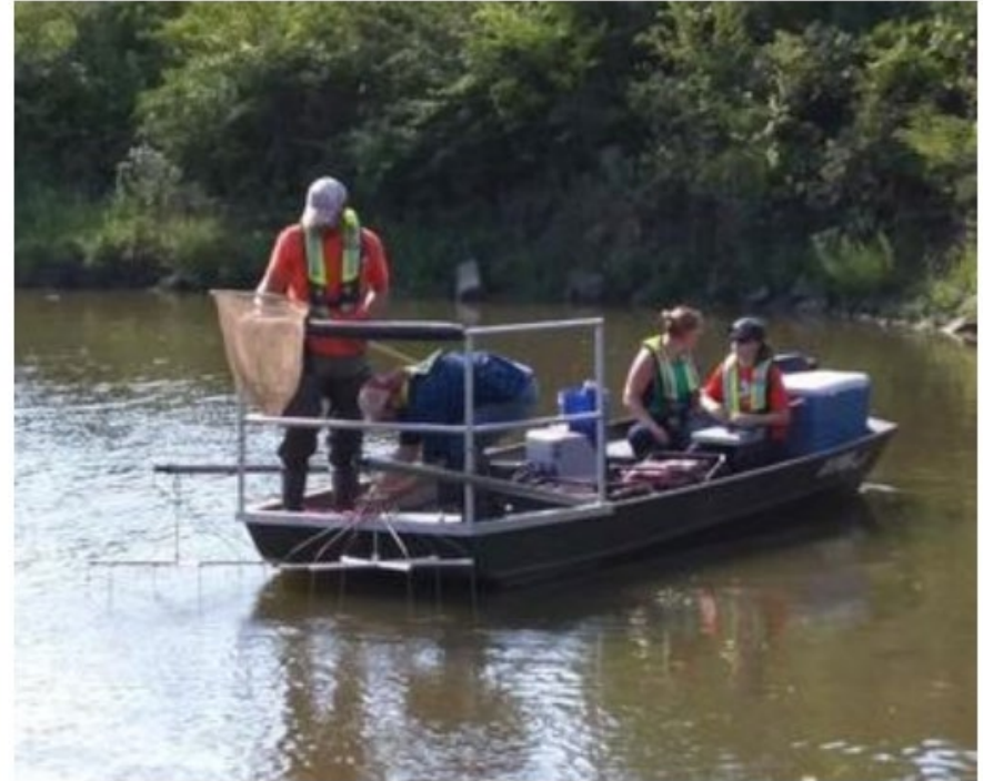
Collection of fish from a pond at the Kansas City Municipal Farm.

https://www.usgs.gov/mission-areas/water-resources/science/urban-waters-federal-partnership-cooperative-matching-funds