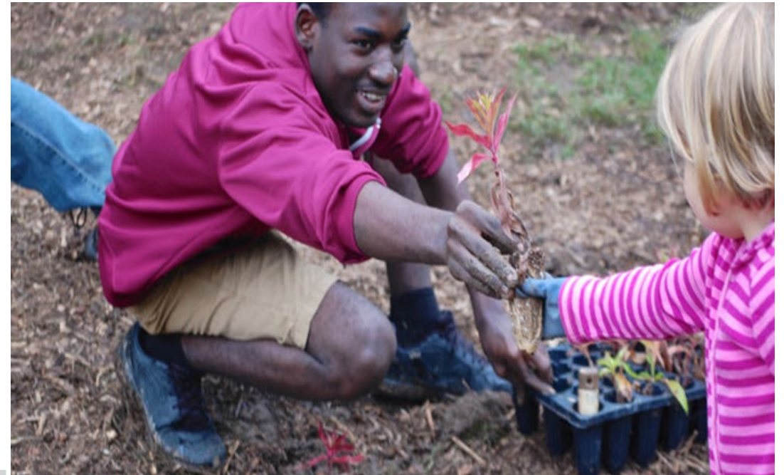
Plaster Creek partners planting in the watershed.

https://www.nfwf.org/programs/five-star-and-urban-waters-restoration-grant-program